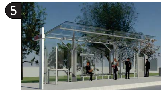
5 Relocate and enhance bus stops