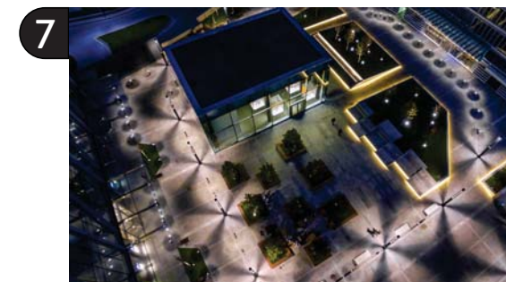
7 Plaza Opportunity with Structural enhancements, Increased Lighting and Avoidance Space