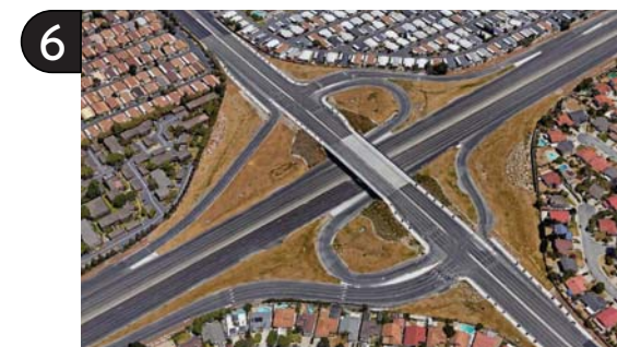
6 Square-up Ramps to Improve Pedestrian & ADA Path of Travel