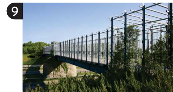
9 Enhanced Protective Railing