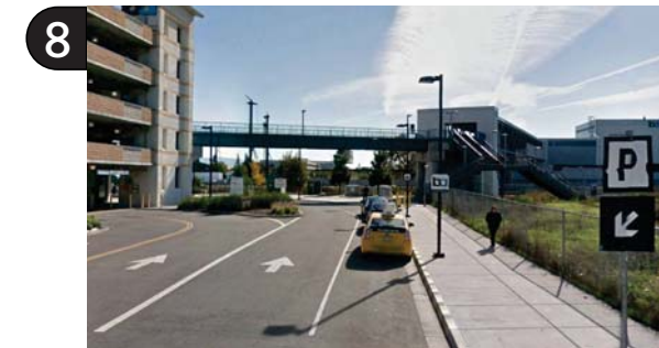
8 Opportunity for enhanced pick-up/drop-off amenities on Watt Overcrossing for Kiss & Ride, TNCs (Uber, Lyft, etc.), and future Autonomous Vehicles