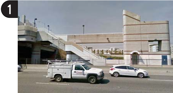
1 Opportunity for New Stairs & Elevator for Single Point of Access to RT Light Rail Station from Watt. Access to station no longer requires crossing under structure.