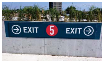
2 Enhanced Signage and Wayfinding