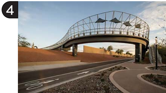
4 Pedestrian Bridge Opportunity for Direct Connection to Watt Ave for direct connection between Watt Ave and future housing development site.